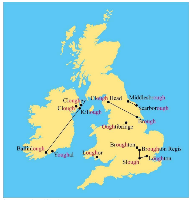
Figure 15-1 The British Isles: many ways to say ough (lines connect similar pronunciation)

The twelve different pronunciations of ough in English geographical names are obviously an extreme example. Although many languages do maintain a more systematic correspondence between writing and pronunciation than English, it is quite common for languages to either use the same character for several different sounds, or apply letters, diacritical marks and combinations thereof in a language-specific way to